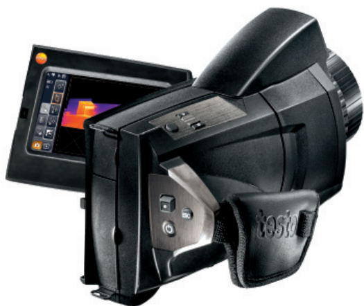
Thermal imager testo 885

More information and answers to all your questions concerning the topics of thermography and the panorama image assistant at www.testo.com .