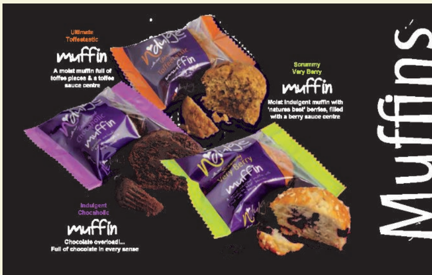
Pack Size 1 x 12