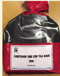
Regency One Cup 1100's Fairtrade Regency One Cup 1100's