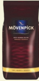
MOV12 Movenpick Cafe Crème 100% Arabica 12 x 500g