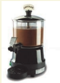
LCD5 5ltr Hot Wonder Hot Chocolate Machine