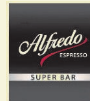
ASB200 Alfredo Espresso Soft pods 200 x 7g