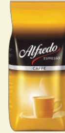
ACA6 Alfredo Espresso Caffè 6 x 1kg