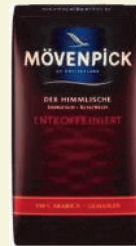
MOD12 Movenpick Decaffeinated 100% Arabica 12 x 500g