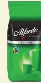
AEF6 Alfredo Espresso Futuro 100%Fair Trade 6 x 1kg