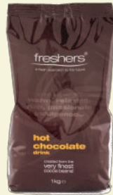
CCO10 Freshers Vending Chocolate 10 x 1kg