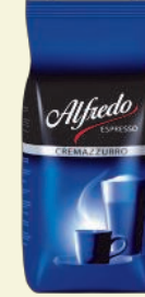
ACR6 Alfredo Espresso Cremazzuro 6 x 1kg