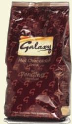
GAL10 Galaxy Hot Chocolate 10 x 1kg