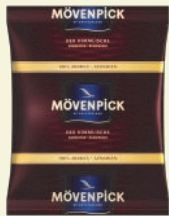
MOV100 Movenpick Filter 100% Arabica 100 x 3 pint