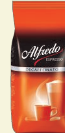
ADE250 Alfredo Espresso Decaffeinato 4 x 250gr Ground