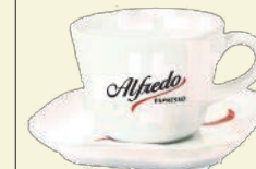
Alfredo Espresso Cups and Saucers Latte or Espresso 1 x 6