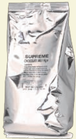
SCO10 Supreme Vending Chocolate 10 x 1kg