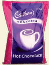
CTC10 Cadburys Top Choc 10 x 1kg