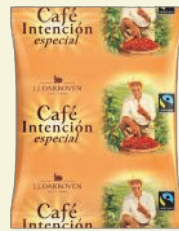
FTC60 Café Intencion Fair Trade Filter Coffee 60 x 3 pints