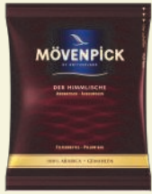
MOV24 Movenpick Filter 100% Arabica 24 x 250g