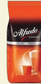
ADE6 Alfredo Espresso Decaffeinato 6 x 1kg