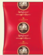
IDD200 Idee Decaffeinated Filter Coffee 200 x 7g