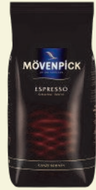
MOE6 Movenpick Espresso 100% Arabica 6 x 1kg