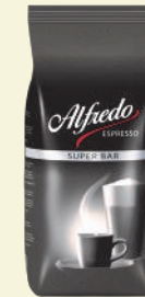
ASB6 Alfredo Espresso Super Bar 6 x 1kg