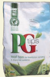
PG Tips Loose leaf 6 x 1kg PG Tips Freeze Dried 10 x 100g