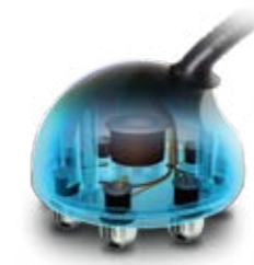
OctiPolar™ - Body Applicator