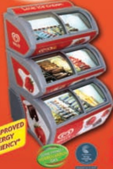
Wall's Slimline Maxivision II