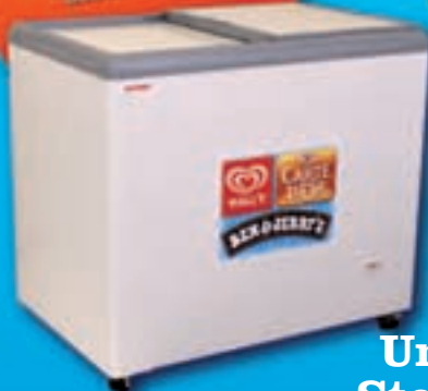
Unilever 1.0m Storage Freezer

From £369 +VAT Plus vouchers for ice cream worth £225 RRP †