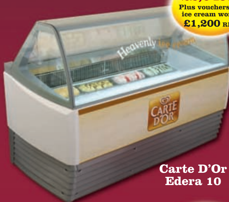
Carte D'Or Edera 10

From £2,049 +VAT Plus vouchers for ice cream worth £1,200 RRP †