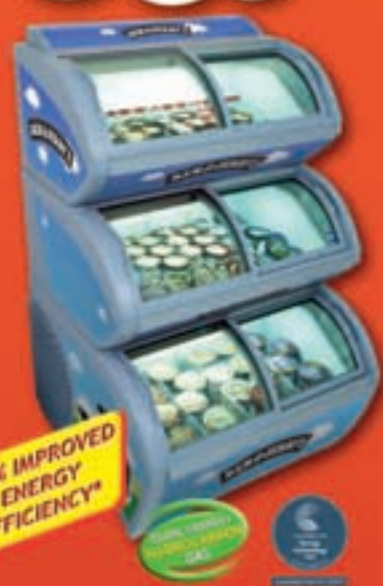
Ben & Jerry's Slimline Maxivision II