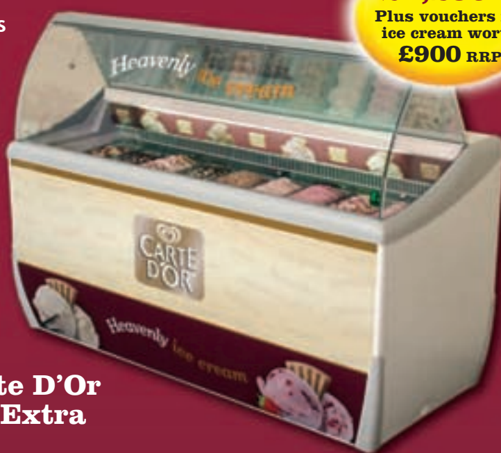
Carte D'Or J9 Extra

From £1,259 +VAT Plus vouchers for ice cream worth £900 RRP †