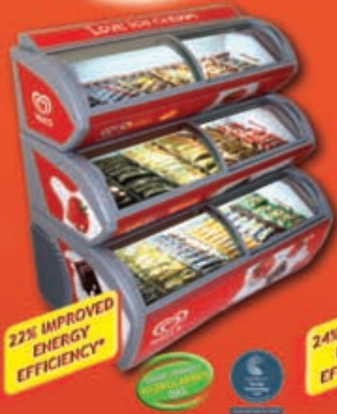
Wall's Maxivision II

£1,119 +VAT Plus vouchers for ice cream worth £600 RRP †