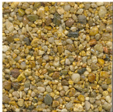
Golden Harvest 15.38