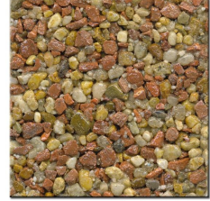
Terracotta Gold 3.21