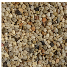
Quartz Parallel 16.39