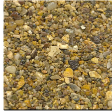
Autumn Harvest 1.17