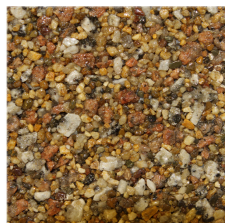
Rustic Bronze 10.33