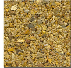
Golden Glow 13.36