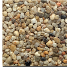
Beige Pearl 22.92