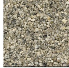
Silver Moon 11.34