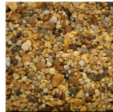
Maple Harvest 18.55