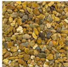
Harvest Crunch 9.32