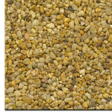
Sesame Gold 12.35