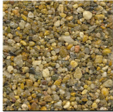
Autumn Forest 14.37

Resin bound porous system for pedestrian traffic and drives