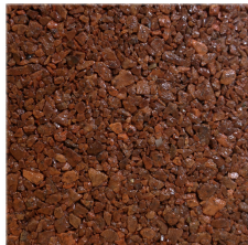
Terracotta Medium 21.80