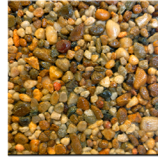
Choc Chip Harvest 20.70