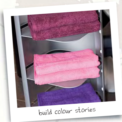
build colour stories