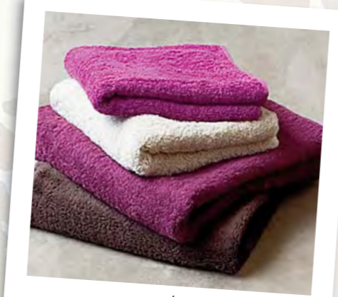
mix it up

We continue to develop new ranges of textiles for beauty. Designed for a feeling of complete luxury and comfort, in modern classic colours to compliment your salon or spa.