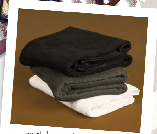
must have salon essentials...