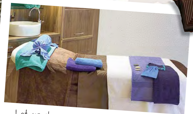
Let us show you our new silk accessories, made to order. Contact us for more details.