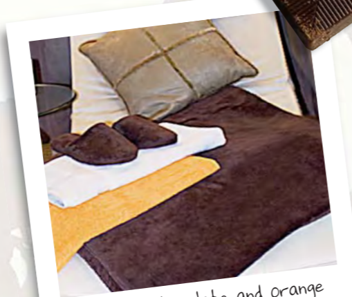
delicious chocolate and orange