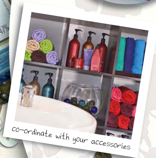
co-ordinate with your accessories