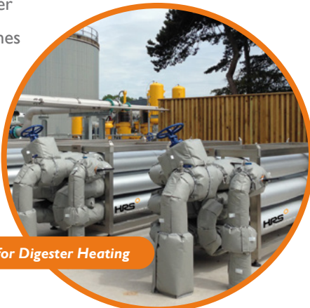
HRS DTI Series for Digester Heating