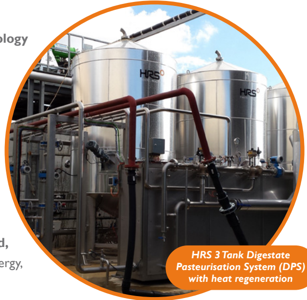
HRS 3 Tank Digestate Pasteurisation System (DPS) with heat regeneration