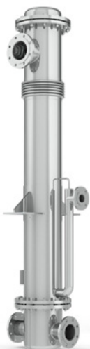
HRS K Series Methanol Condenser