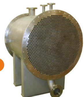
Exhaust Gas Cooler

The HRS G Series is an ideal heat exchanger for cooling CHP exhaust gas. The corrugated tubes can work with smaller heat transfer areas than traditional smooth tube heat exchangers. Our G Series units can be integrated and used to deliver thermal energy from the CHP units to our DPS and DCS systems.