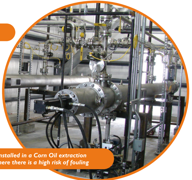
HRS Unicus installed in a Corn Oil extraction application where there is a high risk of fouling