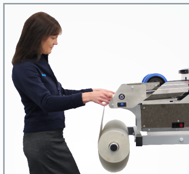
Feed the paper through the rollers