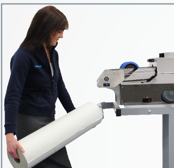
Place the roll of paper on the holder