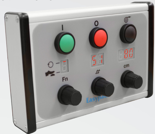
The new digital control panel

The Packsolo system is offered in a range of configurations, each designed to best suit your needs. It can be swiftly installed on a standard frame, or if you have more complex requirements, our design team can work closely with you to integrate the system into new or existing packaging stations.