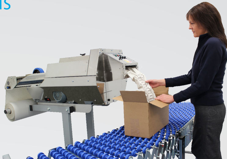
The Packsolo system has the option of being pre-set to operate in either fully automatic or semi-automatic mode; alternatively it can be controlled by a simple footswitch.

Paper cushions are a clean and simple, eco-friendly alternative to traditional void fill methods. Paper rolls for the Packsolo system convert at high speed, to up to 80 times their original volume.