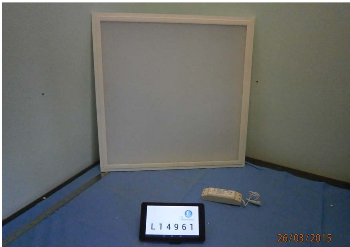
Figure 2. Product image