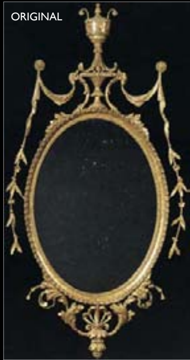
ORIGINAL An oval glass plate in a gadrooned frame flanked by scrolls and leaves, with a scroll cresting and apron. W66 x H130 cm (resized) Ref. MR007 £1,020

Original - Carton Pierre Looking-glass, George III, circa 1765 from Sotheby's Important English Furniture, London, Friday 15th November 1996 est. £7,000-£9,000