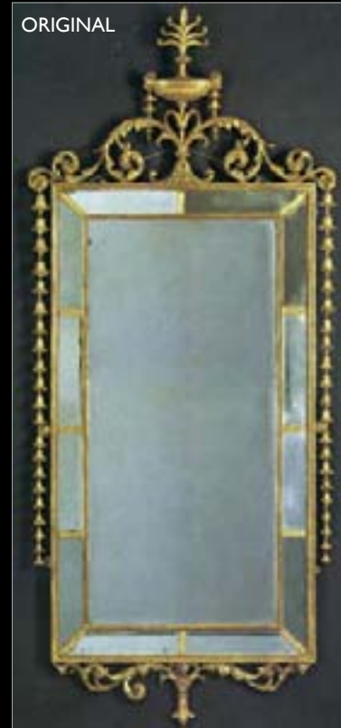
ORIGINAL Elaborate urn cresting with a pair of ram's-heads and scrollwork, with bevelled and beaded borders on the glass. W73.5 x H170 cm (resized) Ref. MR004 £1,020

Original - George III, circa 1775 from Sotheby's Fine English Furniture, London, Friday 9th February 1996. est. £5,000-£7,000