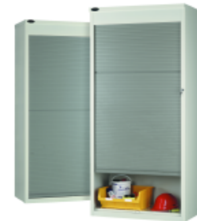
Steel Tambour Cupboard 9 Tambour only available in smoke white or stone grey.