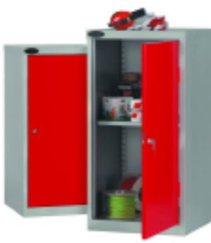
Tool Cupboard 11