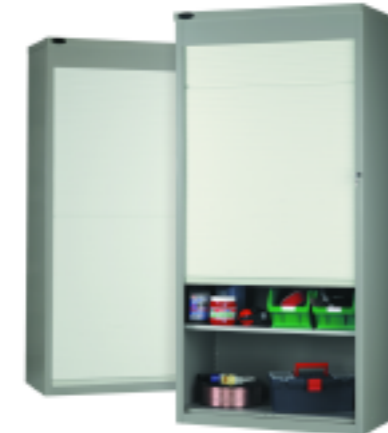
Plastic Tambour Cupboard 10 Tambour only available in smoke white or stone grey.