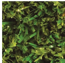
Nearlygrass 40 (Beige)