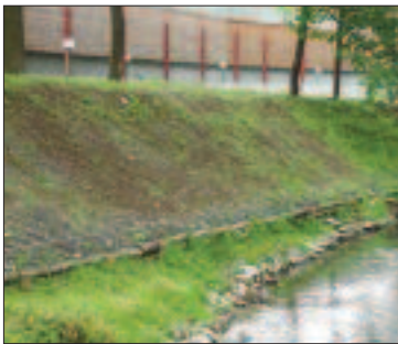
Applications include slope stabilisation