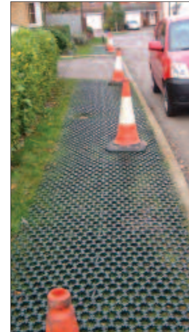
Grassed verge