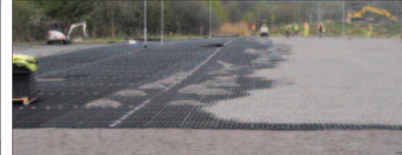
Large parking area under construction – www.gridforce.co.uk