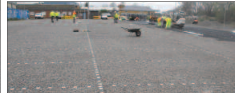
Large parking area completed – www.gridforce.co.uk