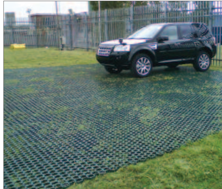
Gridforce tiles are suitable for permanent or temporary parking applications

Their interlocking design means that they are extremely easy to install. The tough grids are laid above or below the ground level, and filled with stone or earth, or can be seeded.