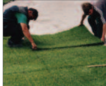
Gridforce tiles are easy to install