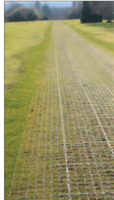
Public park, six months after installation