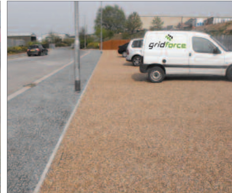
Parking area with Gridforce tiles filled with aggregate – www.gridforce.co.uk