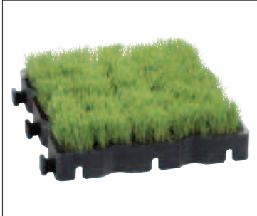
Interlocking tiles can be seeded