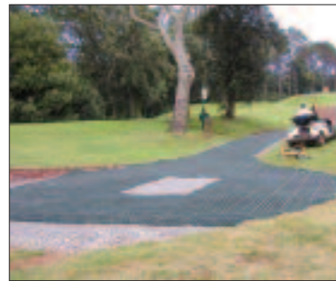
Golf course application