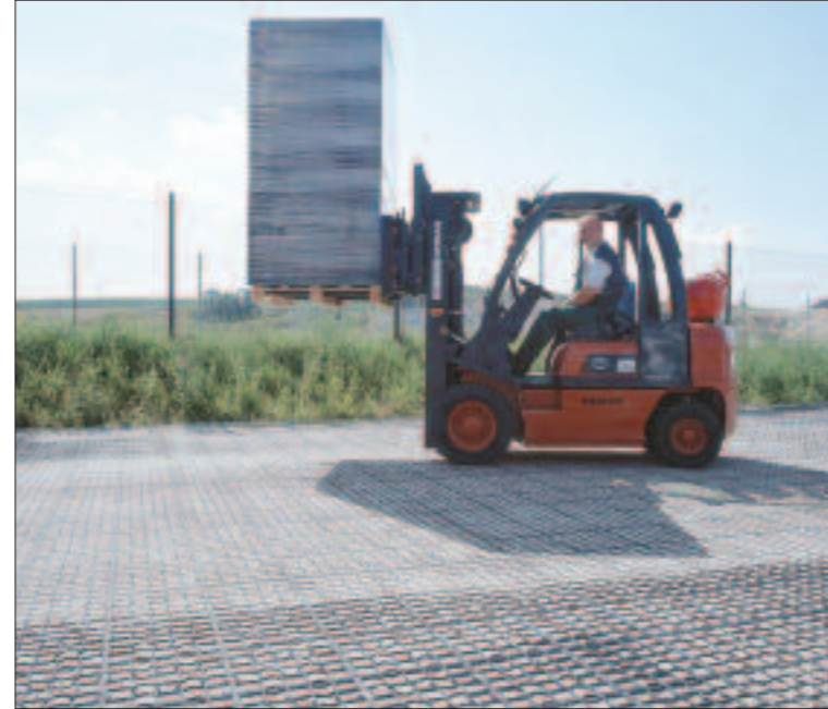
Gridforce tiles provide a firm, stable surface – www.gridforce.co.uk