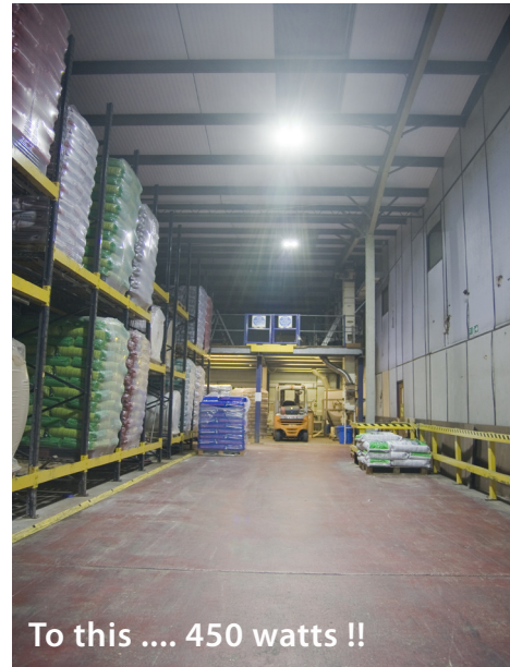
To this .... 450 watts !!