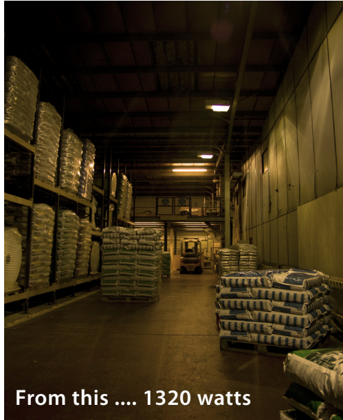
From this .... 1320 watts