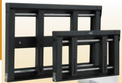
T-T 485-Y02 & T-T 485-Y01

The mounting bracket forms two sections - an external mounting frame that attaches to the wall and an internal frame that is first attached to the flat panel screen. The supports on the internal frame are adjustable to fit most Plasma and LCD screens. When the interior frame is combined with the exterior mounting frame the screen is secured with two hardened, anti-drill security locks. This specially developed flat panel mount maximises security and minimises the threat of theft.