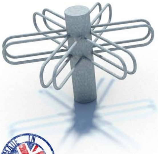
6 Bay Cycle Rack