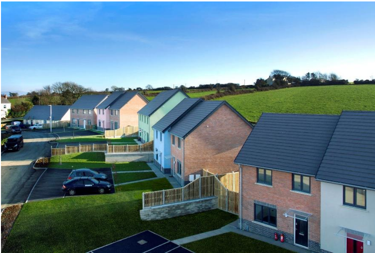
Image 5: Renderplas PVC beads are available in nine natural colours options to match popular render systems.

The image(s) distributed with this press release are for Editorial use only and are subject to copyright. The image(s) may only be used to accompany the press release mentioned here, no other use is permitted.