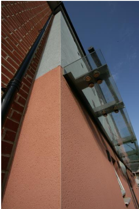
Image 3: Renderplas PVC beads are designed to blend in, leaving a clean, seamless finish.