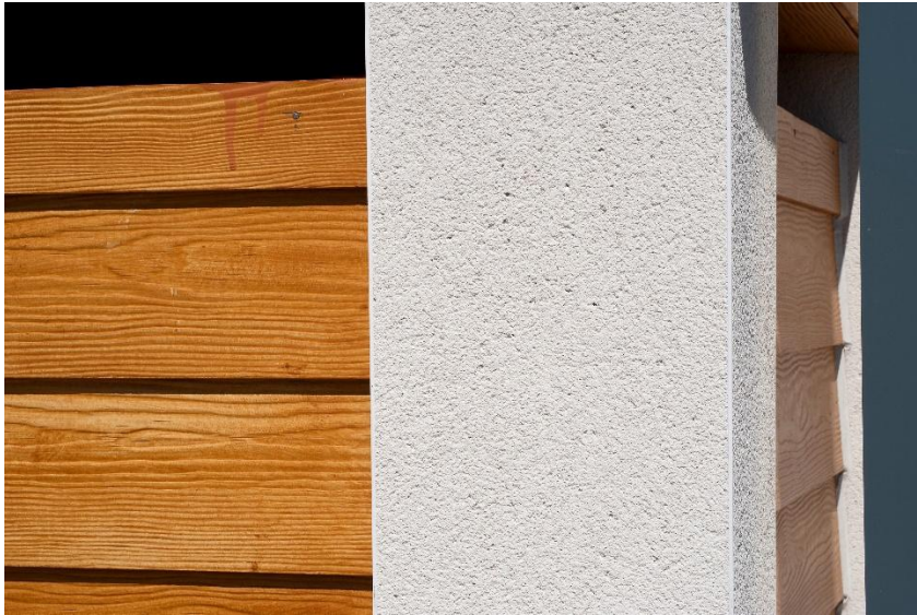
Image 1: Renderplas PVC beads are designed to blend in, leaving a clean, seamless finish.