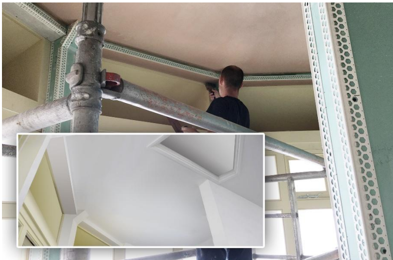
Image 4: For builders and developers, choosing materials that blend seamlessly demonstrates attention to quality and long-term thinking.