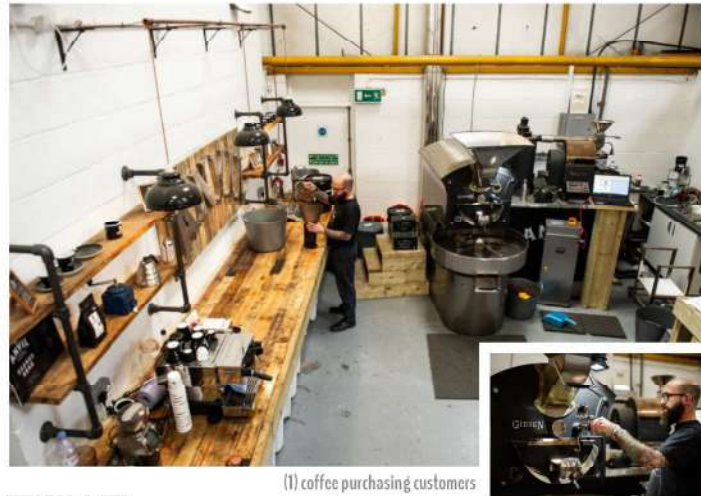
(1) coffee purchasing customers

VISITORS WELCOME (please call before visiting to ensure availability)