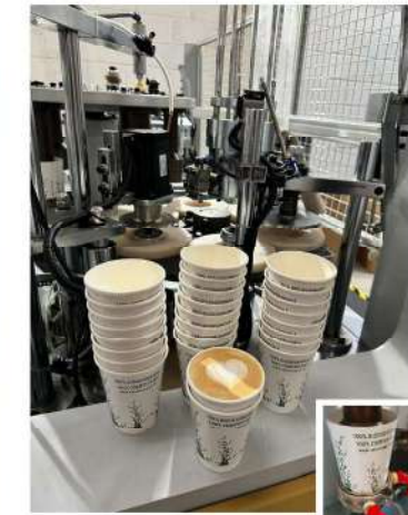
Our cup making machine :-)