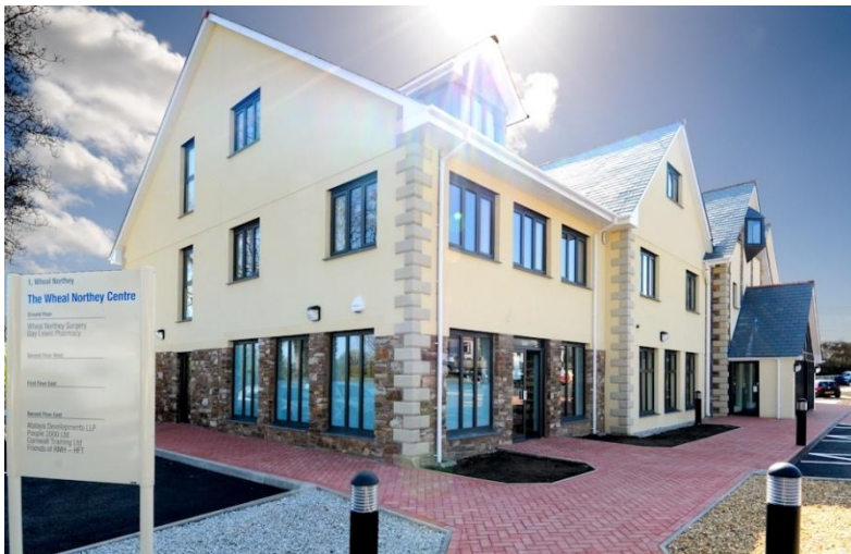
Image 6: Wheal Northey Surgery, an example of successful application of Renderplas PVC beads.

The image(s) distributed with this press release are for Editorial use only and are subject to copyright. The image(s) may only be used to accompany the press release mentioned here, no other use is permitted.