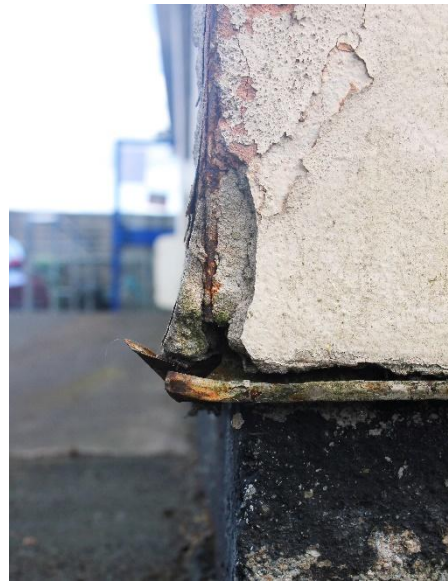
Images 3 & 4: Steel beads are prone to damage from external sources which can leave unpleasant, and in some cases dangerous, damage to render integrity.