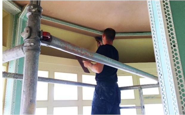
Images 1 & 2: Renderplas PVC beads offer builders a better, safer and stronger alternative to traditional steel beads.